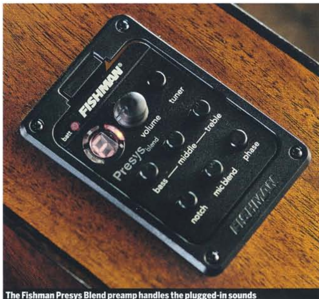
The Fishman Presys Blend preamp handles the plugged-in sounds

In keeping with Giltrap’s ‘original’ Armstrong, fabulous pieces of solid North American red cedar, with tight, ruler-straight grain, have been used for the bookmatched soundboard. A bright, honey-hued selection of mahogany makes the back, sides and five-piece ‘C’ profile stacked-heel neck. Contrasting binding and coach-lining to both the back and front accentuates the VE2000GG’s curves. We particularly like the detailed parquetry featured on the guitar’s back, which serves to join the two pieces of laminate mahogany. This same parquetry runs along the base to where the strap button/jack input is located.